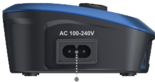
AC Input Power Port 100-240V