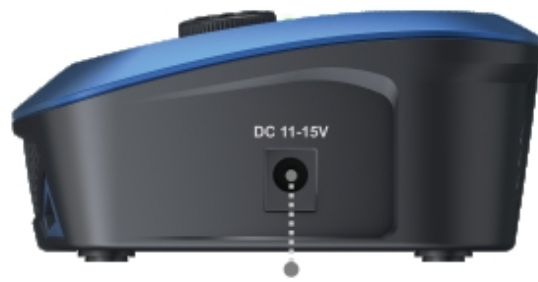
DC Input Power Jack 11-15V