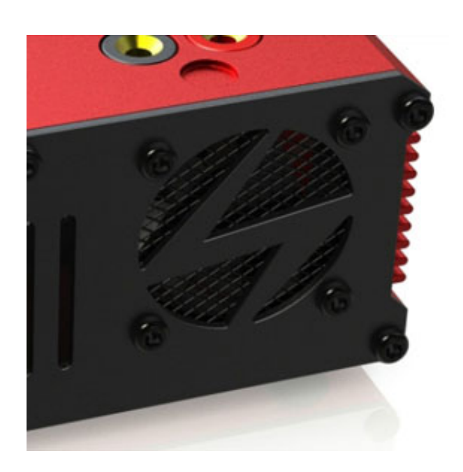
Smart Cooling Fan

Turns on automatically upon the temperature of 50^{\circ} C.