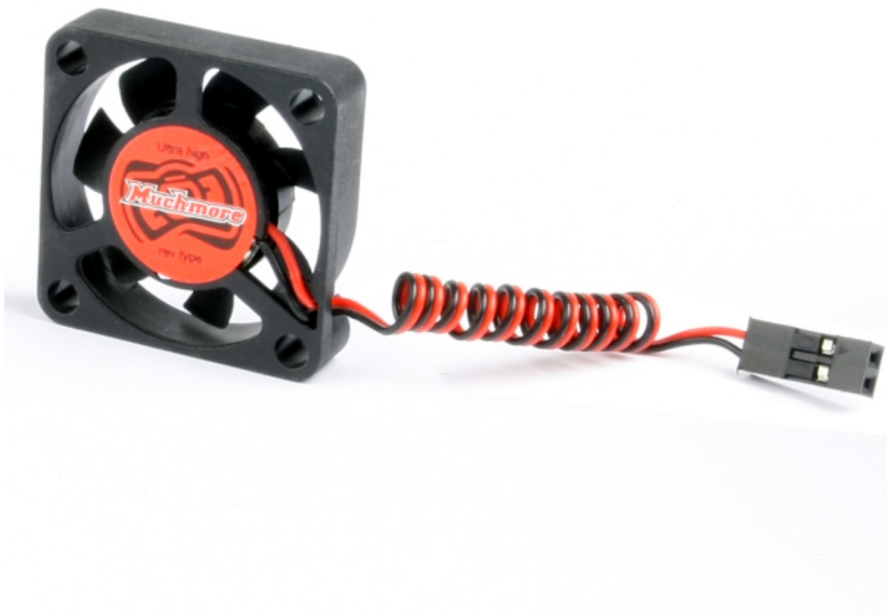
Item No. MR-U30FAN